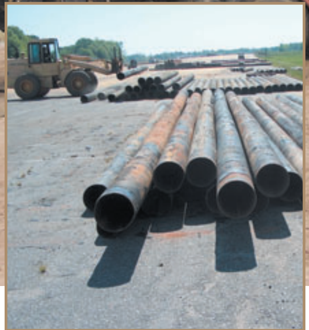
Alpha Pipe's mobile team goes - wherever you need them, when you need them