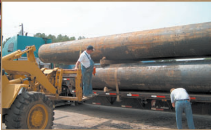
After cleaning, 42" O.D. pipe is loaded for shipment to a client's job site.